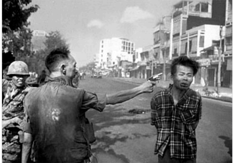
Nguyen Ngoc Loan executes Nguyen Van Lem 1 Feb 1968-1

ferocity of the fighting spread the length and breadth of South Vietnam and lasted well into March in places such as Hue and Khe Sanh. Wendell Berry's second line encapsulates in three brief phrases the sense of disaster and jeopardy registered, but the date of his poem indicates that he is very likely responding to the horrifying image of one Vietnamese partisan executing another on February 1, 1968, an image reproduced in hundreds of newspapers worldwide on February 2, 1968.