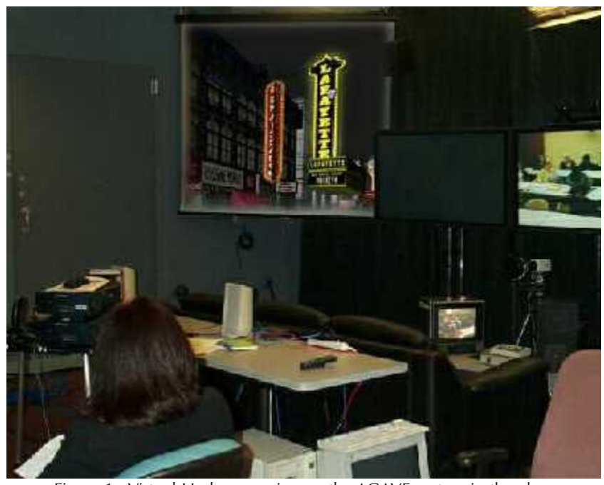
Figure 1. Virtual Harlem running on the AGAVE system in the class-room at UIC next to a remote view of Carter's classroom at CMSU.

During the Virtual Harlem session, UIC students (using either CAVE or AGAVE) navigated around the virtual space with the joy-stick for about 5 to 10 minutes; there was no particular time limit imposed. Typically 3 to 7 students walked around the Harlem space in a group. Meanwhile, CMSU students watched a 10-minute long video movie that contained the Virtual Harlem walk-through with Carter's narration. After exploring the space actively in the CAVE/AGAVE at UIC or passively though video at CMSU, the students wrote evaluations of what they observed in the Virtual Harlem experience and what they thought would be interesting to see in the future. They also compared this experience in Virtual Harlem to what they read about Harlem.