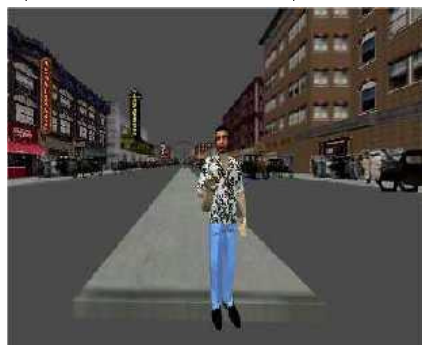
Figure 2. An annotation in Virtual Harlem appears in the form of an avatar (a representation of the person leaving the annotation) which can look or point at locations while talking.

and do fine-grain highlighting to aid memory. Annotations help them understand a text and to make the text more useful in future tasks. We can similarly use annotations within the virtual environment for a variety of tasks. Enhancements to Virtual Harlem include an annotation tool that allows students or instructors to leave annotations throughout the virtual space that can be retrieved by themselves or others in future visits. Virtual annotations are recordings in virtual reality where both the person's hand and head gestures, as well as their voice, are captured. Since the CAVE is automatically capturing the position and orientation of the user's head and hand, the only additional burden on the user is the microphone which records their speech. Since Virtual Harlem is a three-dimensional space, the head and hand gestures allow the user to point toward landmarks in the space and give more nuances to their speech. When the annotations are played back, an avatar appears to re-enact the annotation (Figure 2). Students were encouraged to form their own opinions on the things they saw and heard in the Harlem experience and then to leave annotations that other students could further comment on with their own annotations, creating a 'feed-back' loop. Through this process, we anticipated that students and instructors would spur discussion and