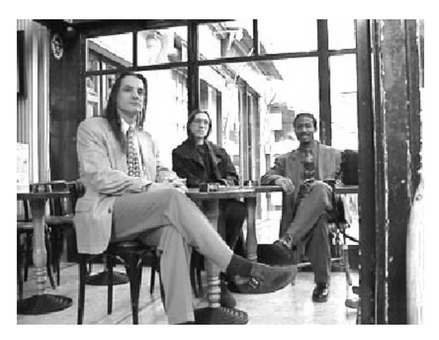
At the Sorbonne